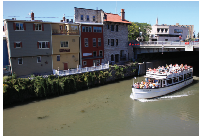
LOCKPORT LOCKS & ERIE CANAL CRUISES