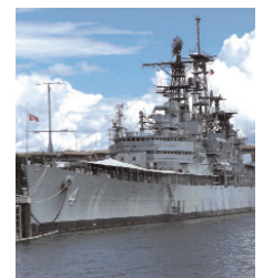
BUFFALO & ERIE COUNTY NAVAL PARK

Buffalo Niagara International Airport (BUF) is 25 minutes away and many low cost carriers fly into BUF. Prefer the train? Amtrak has a stop right in Niagara Falls, New York and there are taxis always waiting when you arrive at the station. Niagara Falls, USA is also an easy ride via Interstate 90.