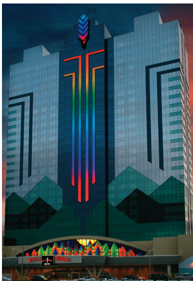
SENECA NIAGARA CASINO

At Niagara Falls State Park you can enjoy our most famous attractions and take in the beauty of Niagara Falls, New York. The Maid of the Mist is a boat tour that brings you up close and personal with the mighty Niagara Falls and you can't get any closer than the Cave of the Winds where you can actually touch the Falls! Try your luck at the Seneca Niagara Casino just blocks from the state park. If shopping is part of your itinerary, Fashion Outlets of Niagara Falls USA will have what you're looking for! North of Niagara Falls is Old Fort Niagara , the site of historic battles since the 1700's, the Fort is an exciting place where the past